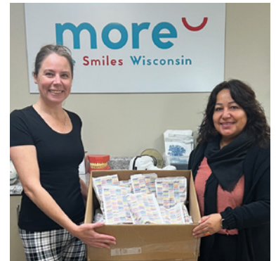
Donation of oral health supplies to support Bayview families.

Oral health is an integral part of our well-being and oral hygiene plays a big part in keeping our mouths healthy. In an effort to promote and support oral health care, MSW distributes oral health supplies to communities in need. This year, one group that MSW was able to support was the resident families of Bayview by providing some oral health supplies for their families.