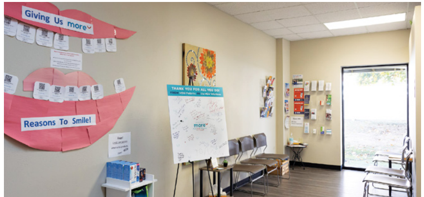
The waiting room at More Smiles Wisconsin's new clinic.

In addition to expanding services, the clinic also undertook a major move to a new location. This relocation was driven by a desire to provide a more modern, spacious, and accessible facility that could better serve the growing needs of the community. This move allowed for the expansion of dental services through the